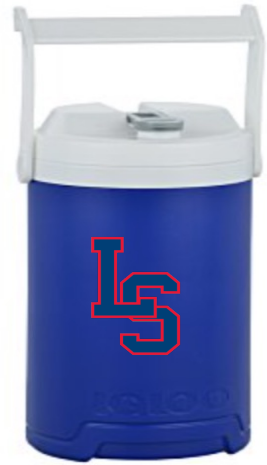
Igloo Sports Jug - 1 Gallon COST: $35/each