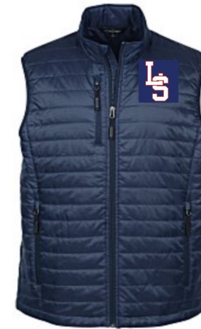
Puffer Vest - Men's COST: $75