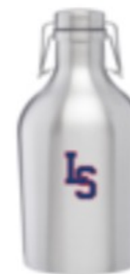
2-Litre Growler COST: $35/each