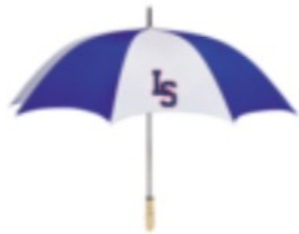
60" Golf Umbrella COST: $40/each