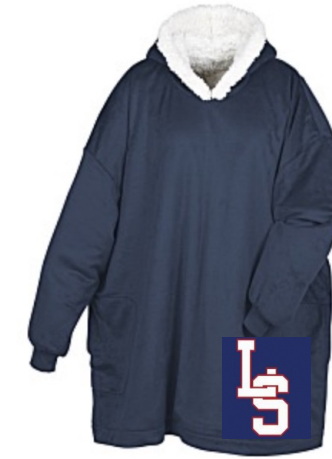
Cozy Wearable Blanket Hoodie COST: $85