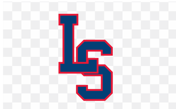
LS Flags - 2' x 3' COST: $30/each