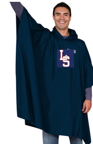
Rain Poncho COST: $25