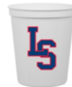
Reusable Plastic Tailgating Cups - 16 oz COST: $25/Dozen